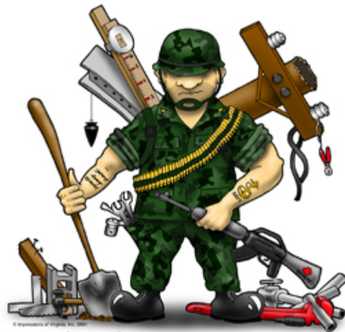
Seabee: (see-bee) n. A fully Automatic, Overworked, Under Paid, MRE Fed, Beer Cooled, Amphibious Animal that thrives on Military Intelligence.

RESOLVED, That this House of Representatives of the State of Rhode Island and Providence Plantations hereby proclaims the month of July to be "Seabee Month" in the State of Rhode Island. We thank them for their heroic service to our nation in its greatest hours of need.