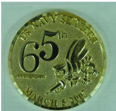
Navy Seabee Veterans of America